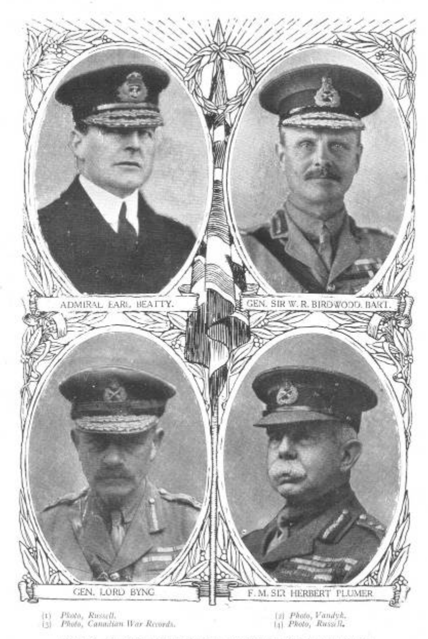
FOUR FAMOUS SCOUTS IN THE GREAT WAR.