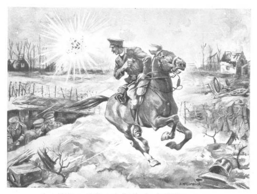
Putting spurs to his horse, the Chaplain galloped cut into the open.