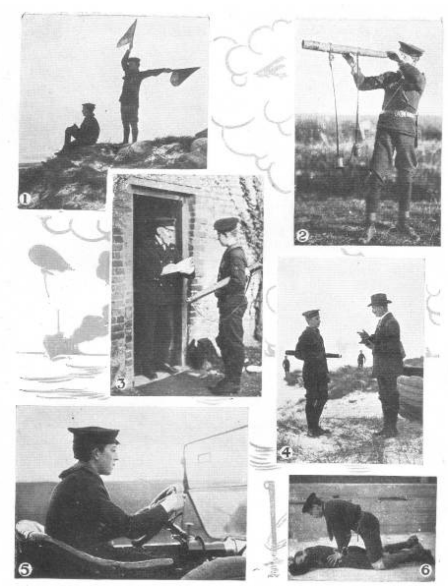
Signalling. 2. Look-out Duty. 3. Reporting to Station Officer. 4. Challenging a Pholographer. Chauffeur to the Coast-watching Officer. 6. Life Saving.