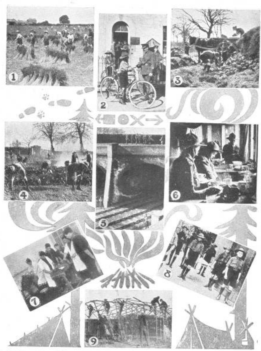
1. Flax Harvesting. Railway Bridge.