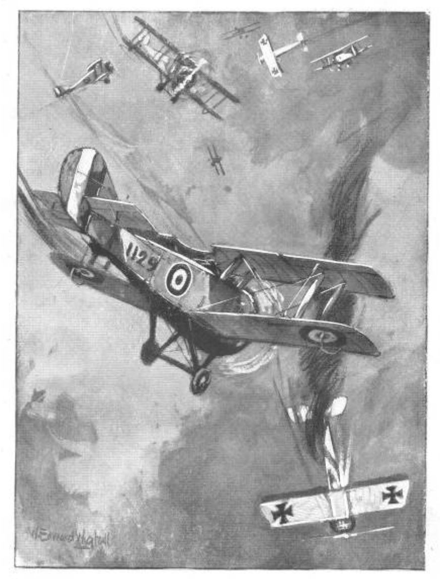
One Fokker staggers for a moment, pitches violently forward, a mass of flames bursts from her, and down she plunges to her doom. (A thrilling incident on page 173).