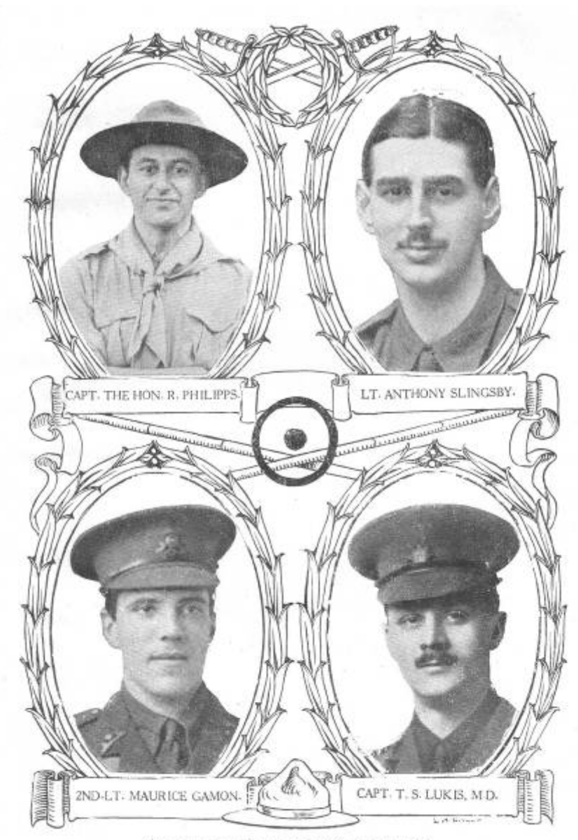
CALLED TO HIGHER SERVICE.