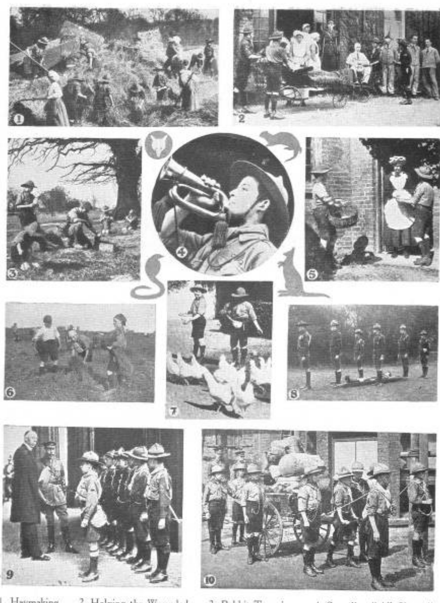
1. Haymaking. 2. Helping the Wounded. 3. Rabbit Trapping. 4. Sounding "All Clear: " 5. Eg3s for the Wounded. 6. Flax Harvesting. 7. Poultry Work. 8. Stretcher Work. 9. Orderly Duty for the King. 10. Waste Paper Collectors. WAR SERVICES OF THE BOY SCOUTS.