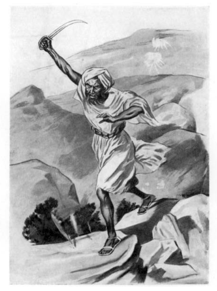
IT WAS A SPLENDIND SIGHT TO SEE HIS RUSH

While the artillery were in the midst of pounding the sungurs we noticed three men, in one sungur , armed only with swords, and who disdained to take cover when the shots came near them, but coolly stood up, waving their curved glittering blades, and evidently encouraging their fellow-tribesmen to make a counter-attack on the British troops, who were now clambering up the face of the position.