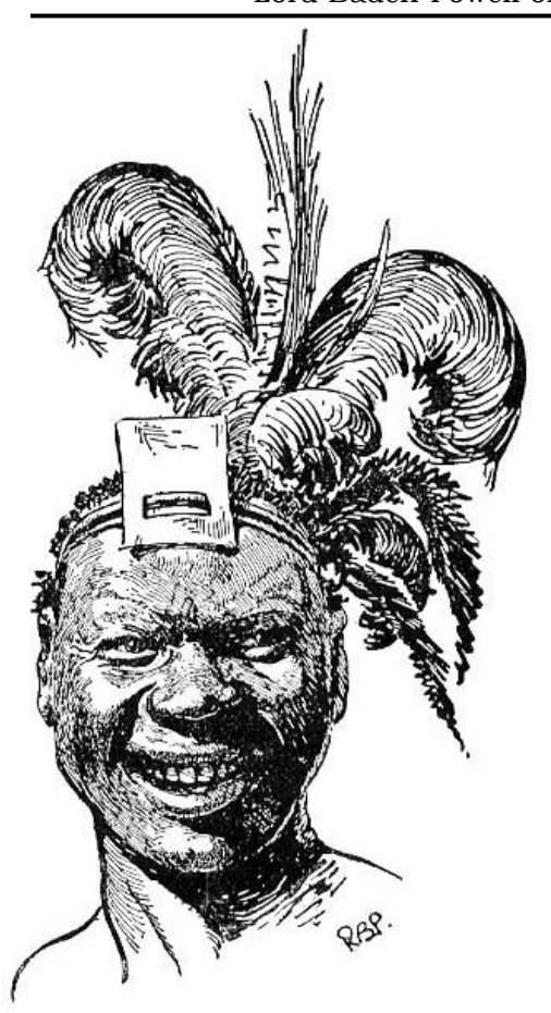
JOKILOBOVU WAS GRINNING

'Well, and we believed what the missionaries told us; so when white men asked if they could come and set up their shops in our country we, the rulers of the nation, welcomed them, knowing that they would show our people how the white man carries out these good precepts in his actual practice of daily life.