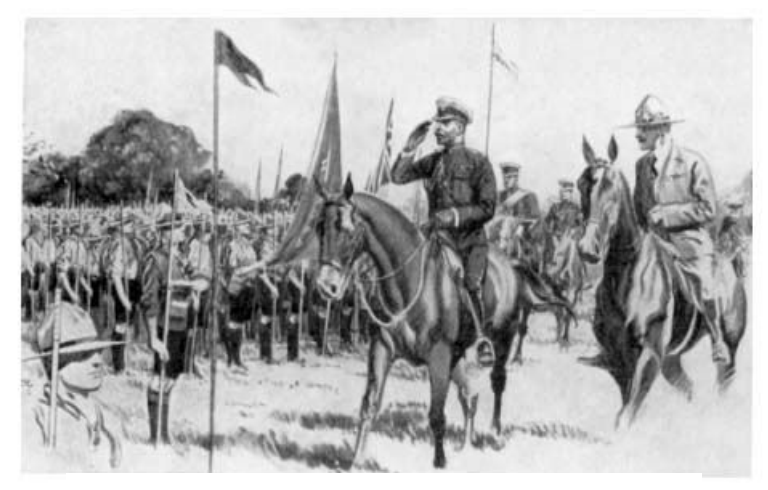
THE KING ARRIVED UPON THE SCENE

The secret of its growth, as I have said, lay in that indeterminate force which we only know as the 'Scout spirit'.