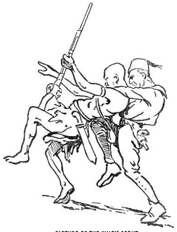
CAPTURE OF THE KING'S SCOUT

There was something pathetic in the parade that followed. From the descriptions by Bowditch of the daily displays and ceremonial at the court of the King of Kumasi over a hundred years ago, one realized that these had altered very little till this day.