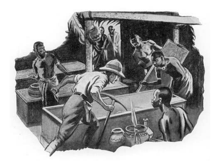
NOTHING BUT EMPTINESS WITHIN

Their humour was one of their great assets. Horrible-looking fellows they were, their heads shaggy with long ringlets where otherwise ordinary men had shaven scalps. And, worst of all, they each wore a life-like reproduction of a third eye in the centre of the forehead.