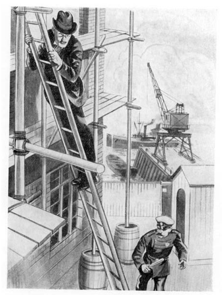
I WAS ONLY HALF-WAY LIP WHEN ROUND THE CORNER CAME ONE OF THE POLICEMEN

Presently he drew nearer to my ladder and, strange as it may seem, I felt safer when he came right below me, and he passed almost under me, looking in at the doorways of the unfinished building. Then he doubtfully turned and looked back at a shed behind him, thinking I might have gone in there, and finally started off and ran on round the next corner of the building. The moment he disappeared I finished the rest of my run up the ladder and safely reached the platform of the scaffolding.